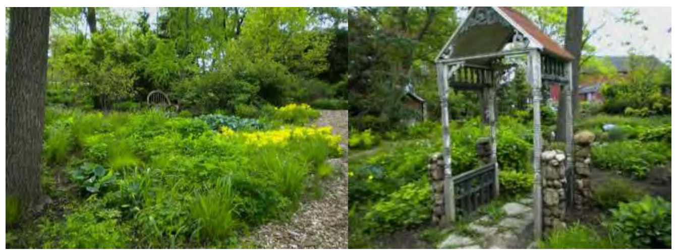
This is a great path leading you around trees. Grasses are a consistant part of the design. There is always a wonderful architecual strucure somewhere on the path.