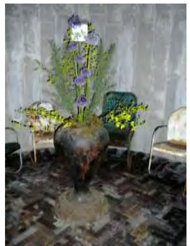
The above is a great stage area. I have been here while there was a play, yet another time, yoga, and another time massages. Picture on the right is in the silo.